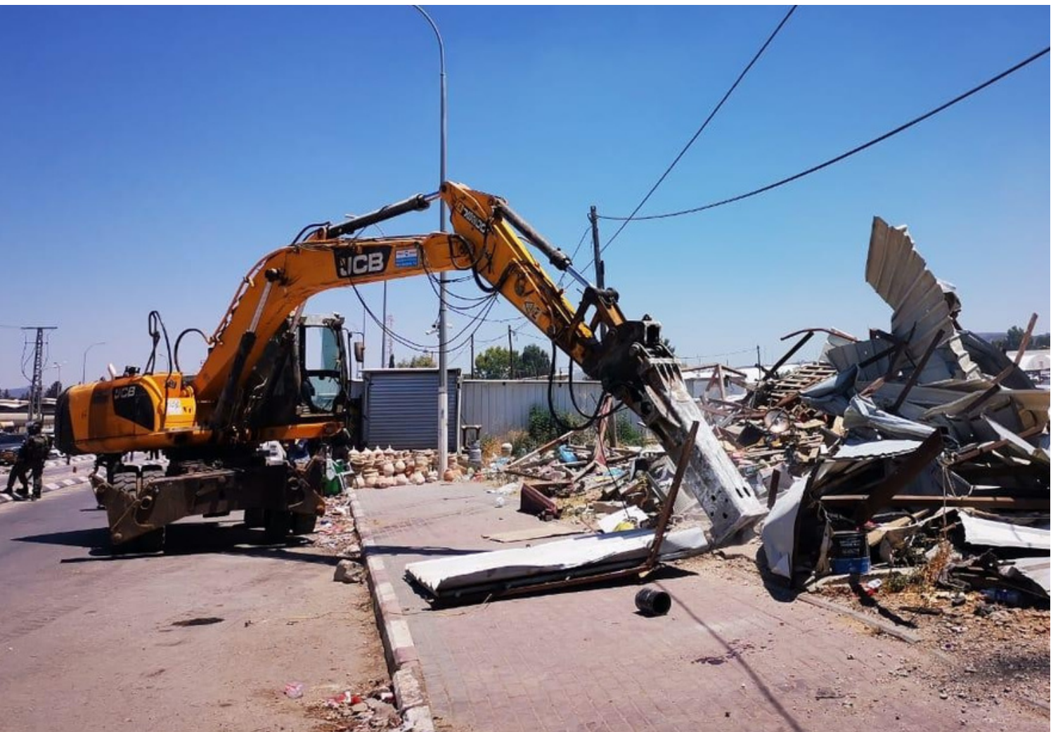
Cover photo: Israeli bulldozers demolish two homes in al-Walaja, 2 Nov 2022. Above photo: A JCB excavator demolishes 3 livelihood structures at al-Jalama checkpoint, 26 July 2022.