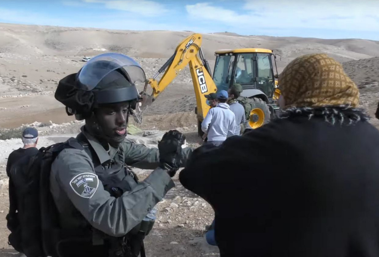
Previous page and above: A JCB backhoe loader is used to destroy the homes of three families in Masafer Yatta, 12 January 2022.