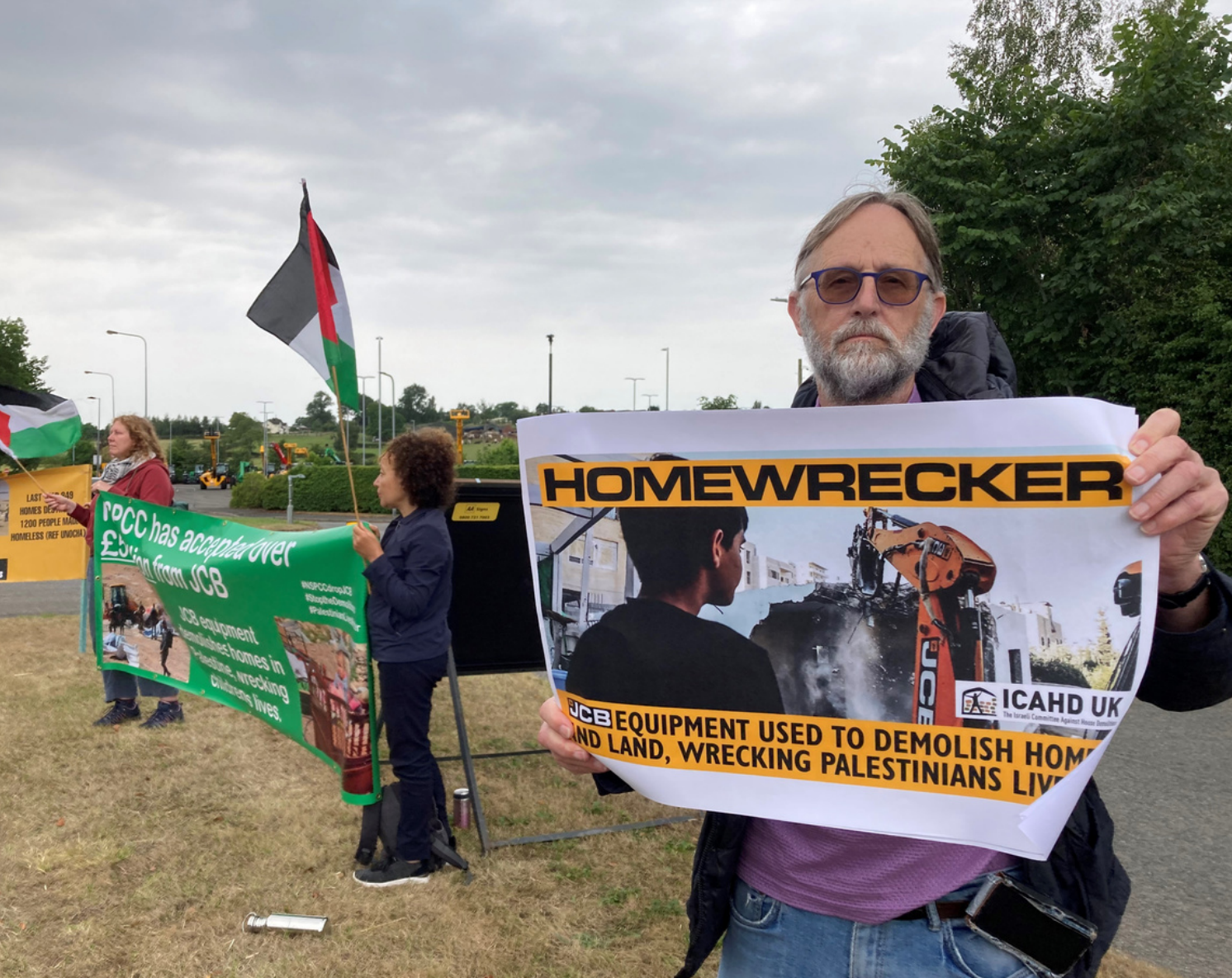
Protesters at the golf tournament.