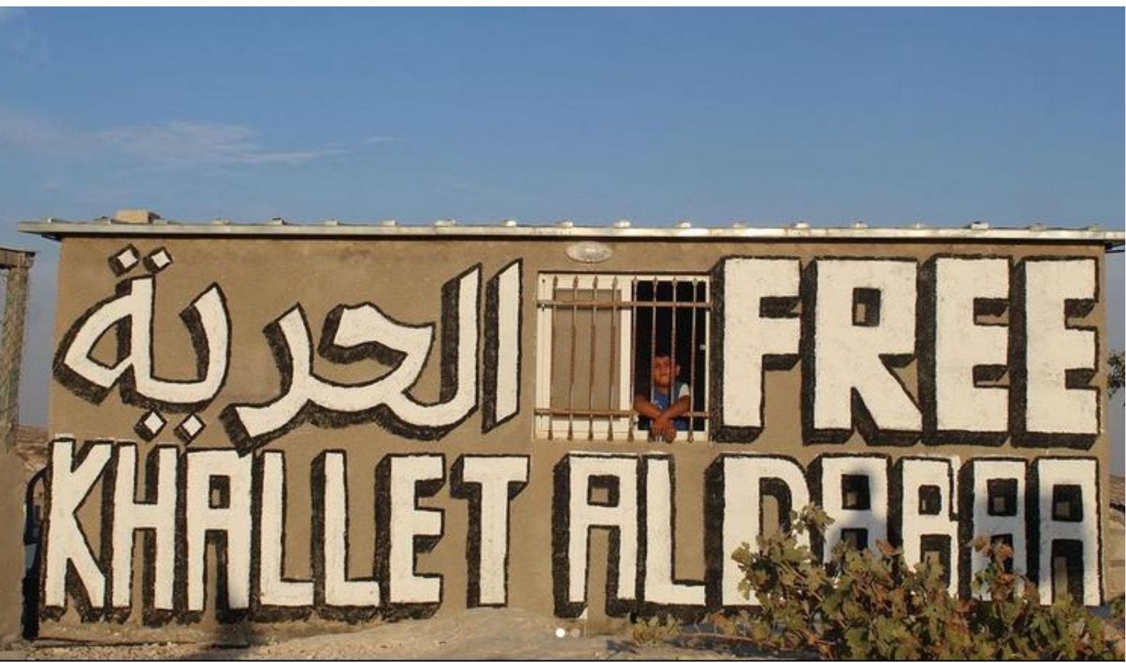
Below: A home in Khamlet al-Dabaa.